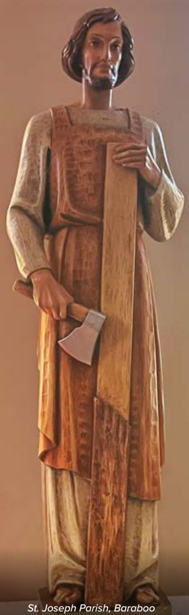
St. Joseph Parish, Baraboo

“In addition to the many funds we hold for parishes and schools, CDMF holds several funds that support specific purposes in the Diocese – Catholic education, spiritual and corporal works of mercy, rural life and pro-life advocacy. These are some of my favorite funds, because of the flexibility it gives us to support different projects every year. In 2020 we were also able to use unrestricted resources to award a special $50,000 grant to help equip Catholic schools to deal with the pandemic in the 2020-2021 school year. In 2021 unrestricted funds were used to triple the amount of scholarship support we could give to Catholic schools. I speak for the entire CDMF board in saying that we are humbled and honored to have the opportunity to steward God gifts to support such important work in the Diocese.”