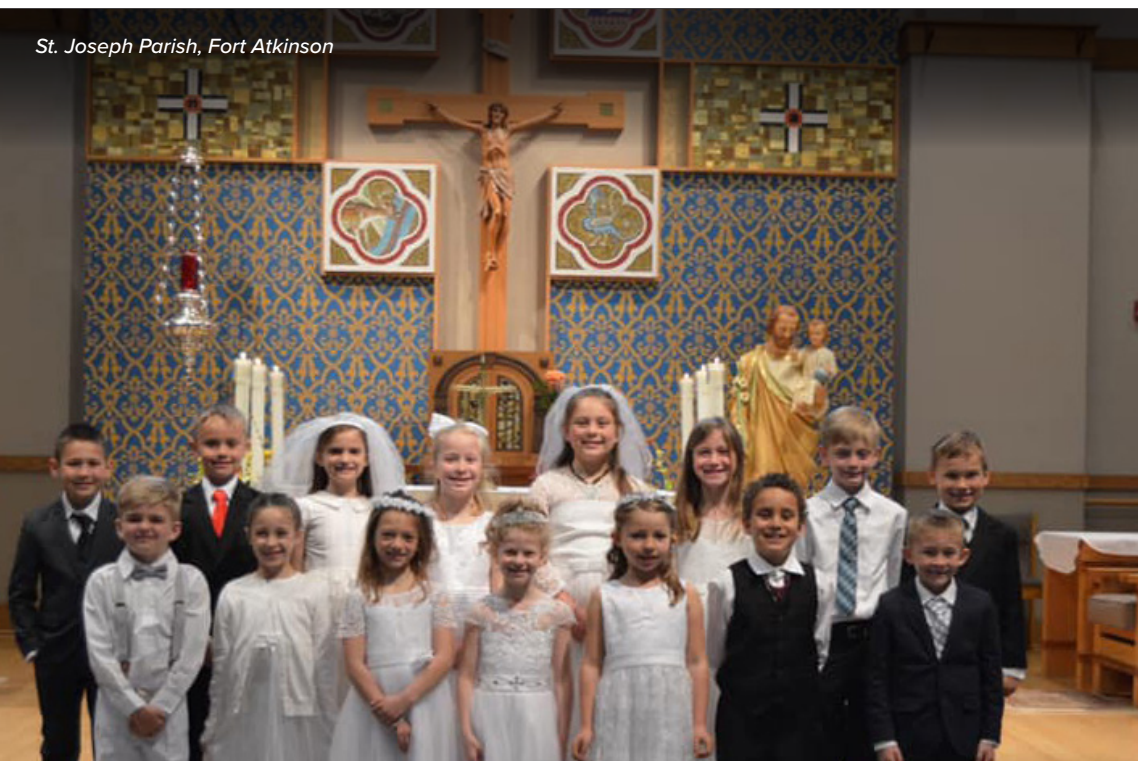
St. Joseph Parish, Fort Atkinson