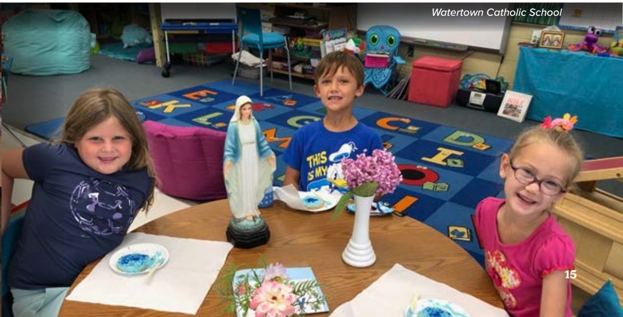
Watertown Catholic School