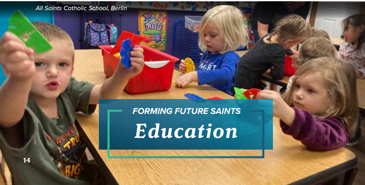
All Saints Catholic School, Berlin